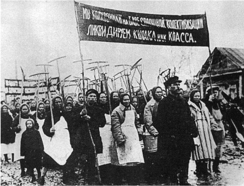
Collectivization campaign, USSR circa 1930 ('We kolkhozniks are liquidating the kulaks as a class, on the basis of complete collectivization').

to see a shape or logic—a development from past to future—to the last hundred years. It opens us, I think rightly, to a vision of the period as catastrophe in the strict sense: unfolding pell-mell from Sarajevo on, certainly until the 1950s (and if we widen our focus to Mao's appalling 'Proletarian Cultural Revolution'—in a sense the last paroxysm of a European fantasy of politics—well on into the 1970s): a false future entwined with a past, both come suddenly from nowhere, overtaking the certainties of Edwardian London and Vienna; a chaos formed from an unstoppable, unmappable criss-cross of forces: the imagined communities of nationalism, the pseudo-religions of class and race, the dream of an ultimate subject of History, the new technologies of mass destruction, the death-throes of the 'white man's burden', the dismal realities of inflation and unemployment, the haphazard (but then accelerating) construction of mass parties, mass entertainments, mass gadgets and accessories, standardized everyday life. The list is familiar. And I suppose that anyone trying to write the history that goes with it is bound to opt, consciously or by default, for one among the various forces at work as predominant. There must be a heart of the matter.