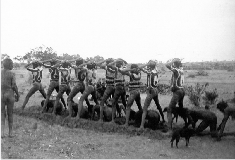
Baldwin Spencer, 'Final burial ceremonies', Tennant Creek, 23 August 1901; in Photographs of Baldwin Spencer , plate 75.

just tired to death. All that needs restating here—and Baldwin Spencer's great photos of the longest continuing human culture are the proper accompaniment—is that the arrival of societies oriented toward the future, as opposed to a past of origins, heroisms, established ways, is a fact of history not nature, happening in one place and time, with complex, contingent causes. Personal religion (that strange mutation) and double-entry book-keeping being two of them. And by modernity is meant very much more than a set of techniques or a pattern of residence and consumption: the word intends an ethos, a habitus, a way of being a human subject. I go back to the sketch I gave in a previous book: