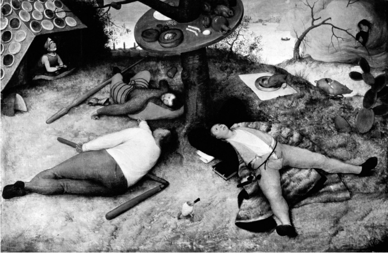
Pieter Bruegel the Elder, 'The Land of Cockaigne', 1567. Alte Pinakothek, Munich.

realities they pretend to transfigure. Every Eden is the here and now intensified; immortality is mortality continuing; every vision of bliss is bodily and appetitive, heavy and ordinary and present-centred. The man emerging from the mountain of gruel in the background is the 'modern' personified. He has eaten his way through to the community of saints.