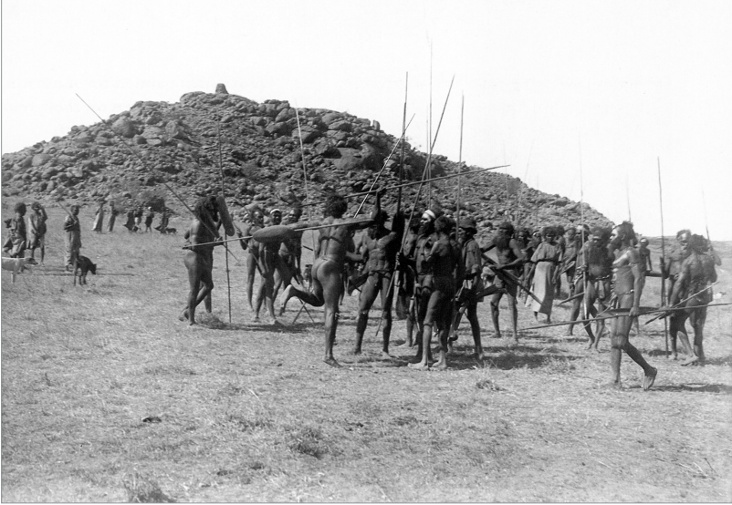
Baldwin Spencer, 'Men quarreling after accusations over disobedience of social laws', Alice Springs, 9 May 1901; in The Photographs of Baldwin Spencer , Carlton VIC 2005, plate 36.

with hatred or the arrogance of triumph, the wounded doubled up in pain, the dying in agony? Why did the whole Greek world exult in the pictures of fighting in the Iliad ? I fear we do not understand these things in enough of a Greek fashion . . . and we would shudder if we did . . . 12